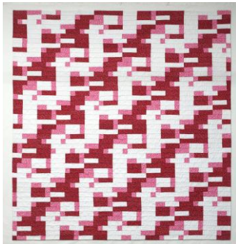
Be My Valentine